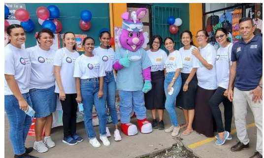
Figure 6 Dental Teams from Valelevu, Lami, Labasa and Laucala Beach Estate