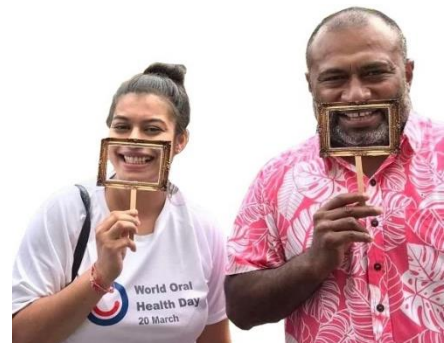
Figure 2 Hon. Minister of Health, Dr Ifereimi Waqainabete and Fiji National University Lecturer, Dr Kartika Kajal

for future dental care to all who participated in activities for the day. Approximately 70% of those who attended the free checks were interested in being contacted for appointments with dental students at the Fiji National University for subsequent treatments.